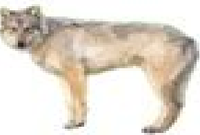
Vancouver Island Wolf