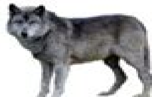
Mackenzie River Wolf