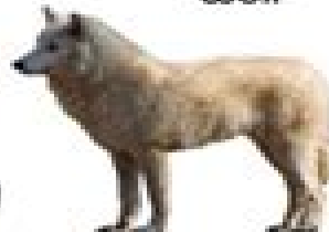
Hudson Bay Wolf