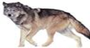
Northern Rocky Mountain Wolf