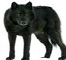
Alexander Archipelago Wolf