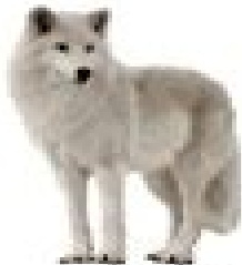
Alaskan Tundra Wolf