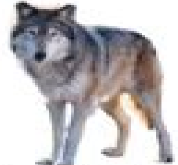
Interior Alaskan Wolf