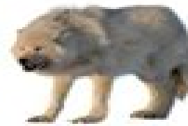
Baffin Island Wolf