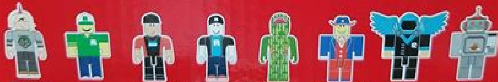
ReesePillbox Ripout Roblox Staff Roblox Super Fan Sharkie Uncle Ben's Uncle Vasa Marsman Robot