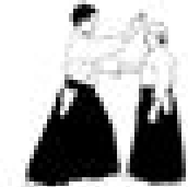
Mune Dori Men Uchi (Collar Grab and Strike to the Face)