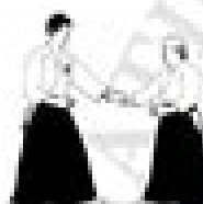
Gyaku-Hanmi Katate Dori (Underhand Grip)