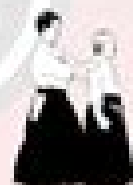
Ushiro Ryokata Dori (Two Hands Grasping Both Shoulders From Behind)