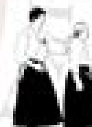
Ushiro Eri Dori (One Hand Grasping Collar From Behind)