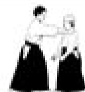
Ryokata Dori (Two Hands Grasping Both Shoulders)