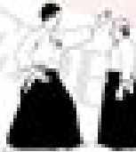
Shomen Uchi (Overhead Strike to the Head with the Blade of the Hand)