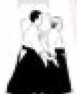
Ushiro Ryote Dori (Two Hands Grasping Two Wrists From Behind)