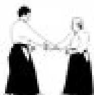
Ai-Hanmi Katate Dori (Overhand Grip)