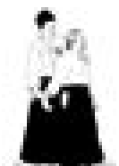
Ushiro Kubishime Dori (Back Collar Grab From Behind)