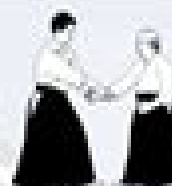
Morote Dori (Two Hands Grasping One Wrist)