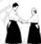
Ryote Dori (Two Hands Grasping Two Wrists)