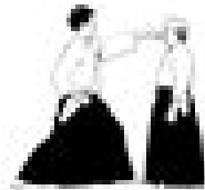
Shomen Tsuki (Straight Punch to the Face)