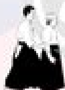
Ushiro Sode Dori (Two Hands Grasping Two Sleeves From Behind)