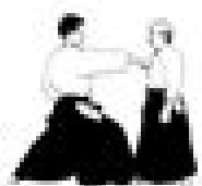
Mune Tsuki (Straight Punch to the Chest)