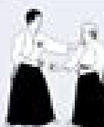
Kata Dori (Shoulder Grip)