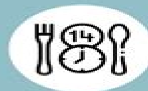
14:10 intermittent fasting