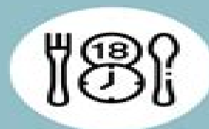
18:6 intermittent fasting