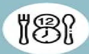
12-hour intermittent fasting