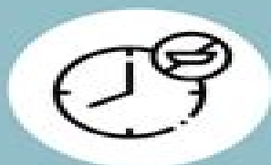
Skipping a meal