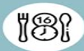
16:8 intermittent fasting