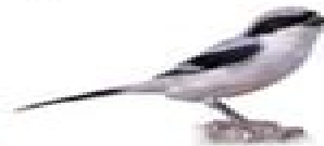
Great Gray Shrike