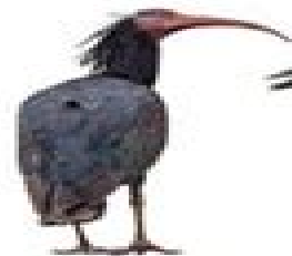
Northern Bald Ibis