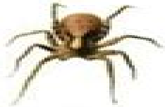
Arctic Wolf Spider