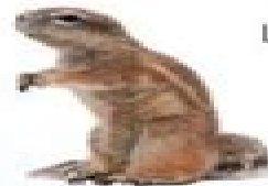
Arctic Ground Squirrel