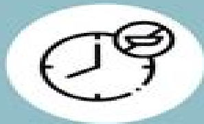
Skipping a meal