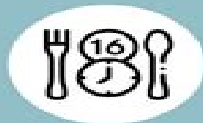
16:8 intermittent fasting