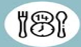
14:10 intermittent fasting