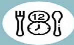
12-hour intermittent fasting