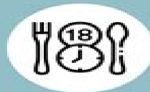
18:6 intermittent fasting