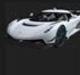
2018 Sports Car // Rosh