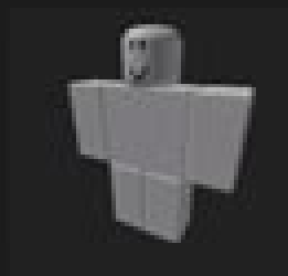
R6 Dummy Rig