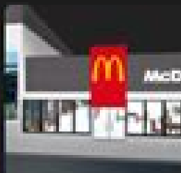
McDonalds with parking lot