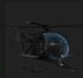
MD Helicopters MH-6 Little Bird