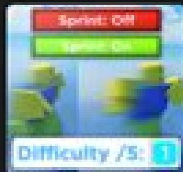
Sprint/Run Button System