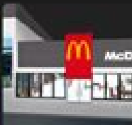
mcdonalds with parking lot