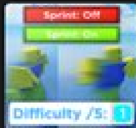
Sprint/Run Button System