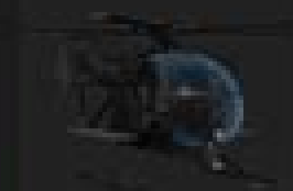
MD Helicopters MH-6 Little Bird