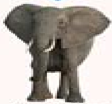
African Bush Elephant