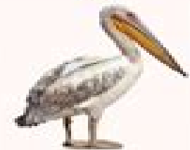
Great White Pelican