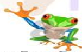
Red Eyed Tree Frog