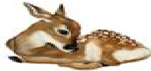
White tailed deer