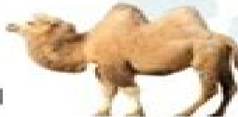
Wild Bactrian Camel