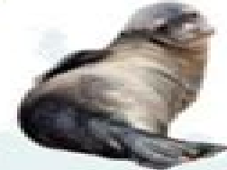
Hawaiian Monk Seal