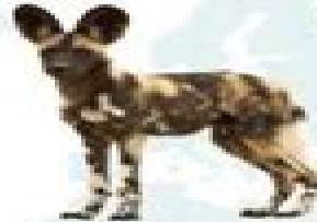
African Wild Dog