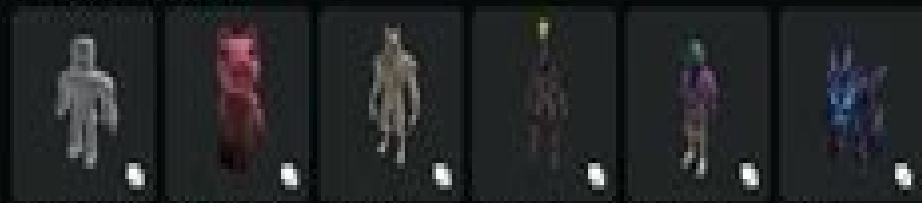
Robloxian 2.0 Schweinchen Tribal Wolf Eisenkette Nick Barock U'ral